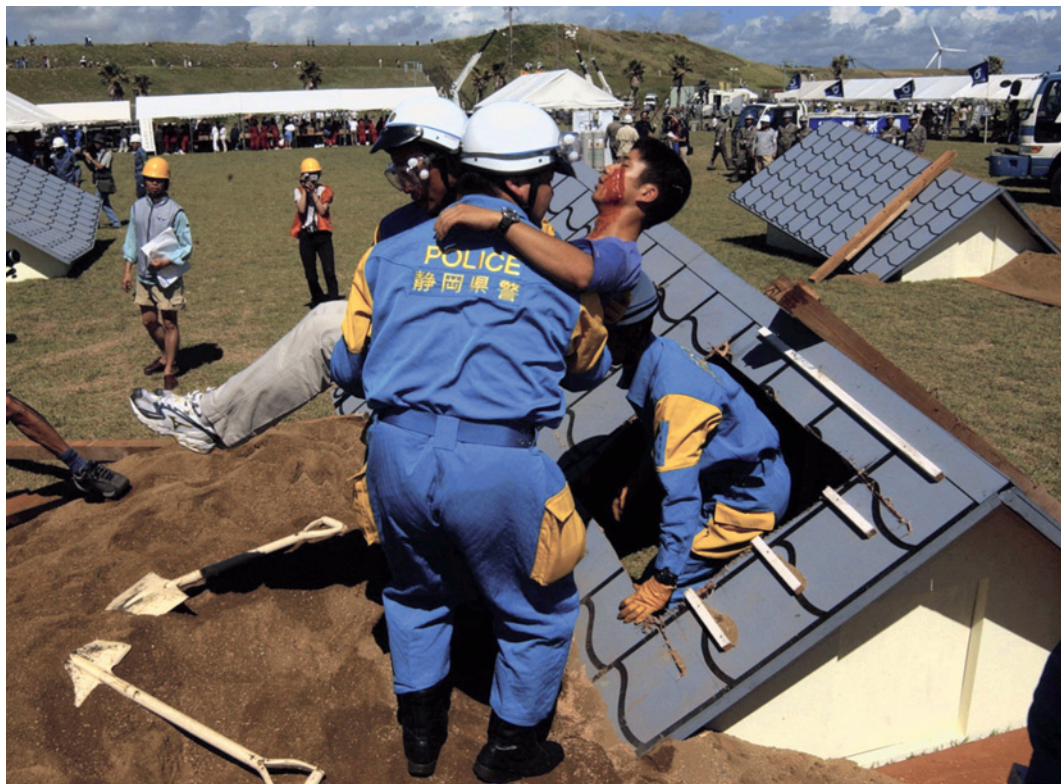
Emergency drills such as this mislead the public into believing that the Tokai district is due a magnitude-8 quake soon.